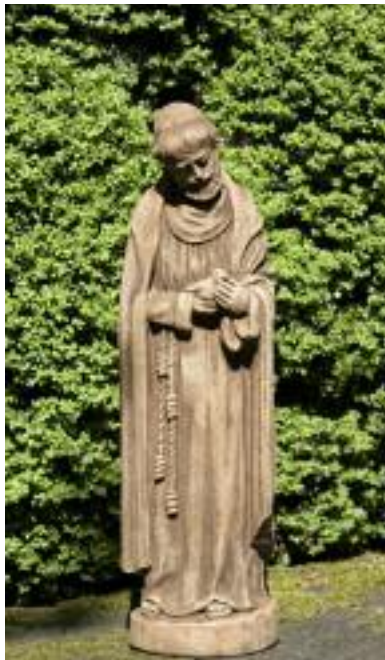
ST FRANCIS W/BABY BIRD R-101 125 LBS - 10.5" x 7.5" x 36.5"