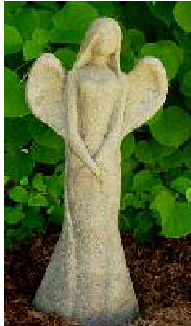
GENTLE ANGEL ST154 H: 19"