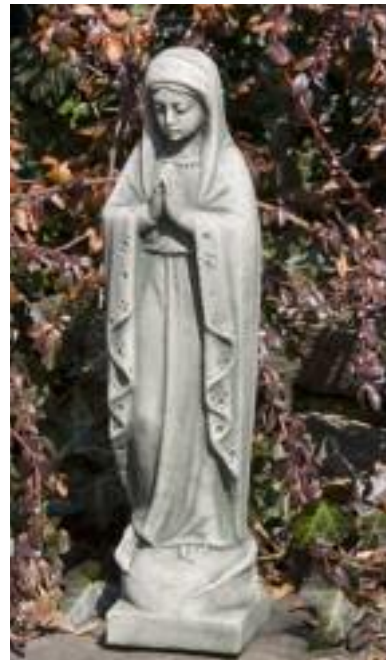
14" MADONNA R-055 7 LBS - 4" x 3" x 14"