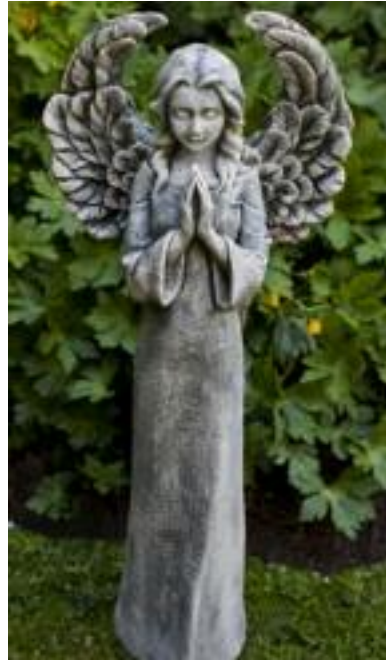
FIONA'S ANGEL R-114 42 LBS - 12.50" x 6.50" x 26.50"