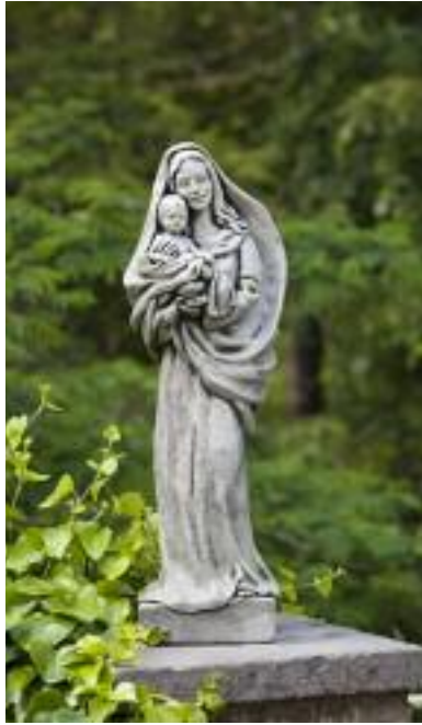
STANDING MADONNA AND CHILD R-105 71 LBS - 8.5 x 10 x 30.25"