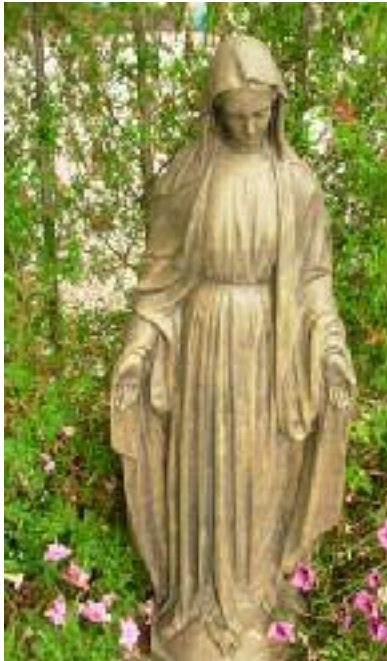
TALL MARY ST097 H: 41"