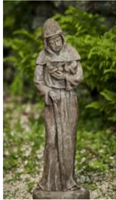
WOODLAND ST. FRANCIS R-108 30 LBS - 8" x 8" x 26"