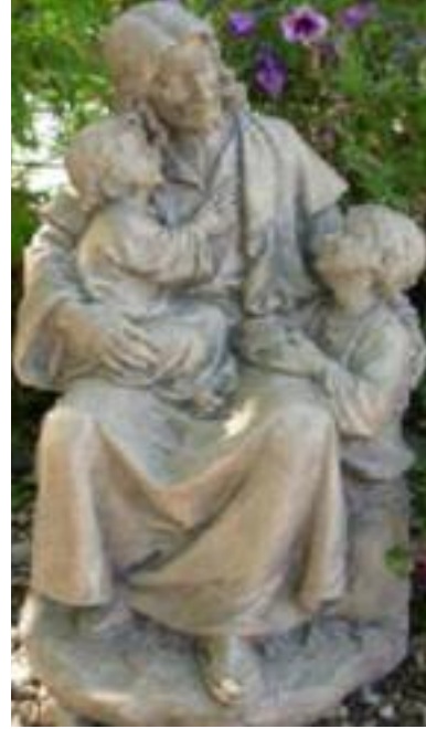
JESUS WITH CHILDREN ST189 H: 19"