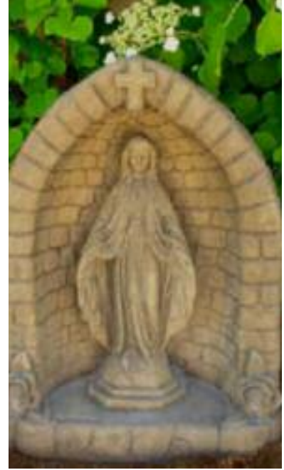
MARY WITH GROTTTO ST157 H: 24" L: 17"