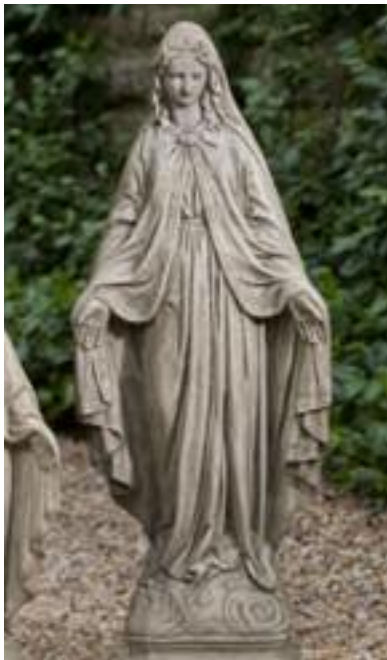
MADONNA MEDIUM R-042 45 LBS - 10.25" x 6.5" x 26"