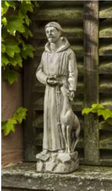
SMALL ST-FRANCIS R-112 11 LBS - 5.25" x 4.25" x 17.75"