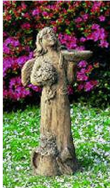
GARDENING ANGEL C-078 69 LBS - 11.5" x 13" x 27.5"