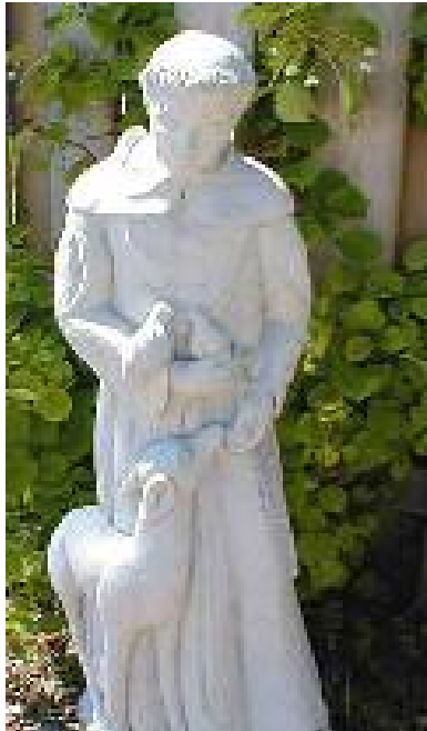
ST-FRANCIS ST029 H: 40.5"