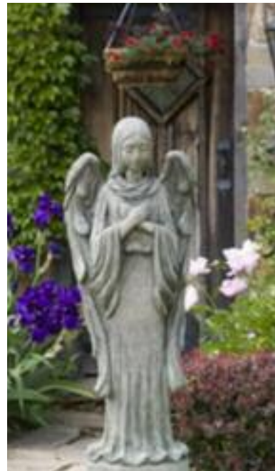
AUTUMN ANGEL R-060 64 LBS - 8" x 11.75" x 32"