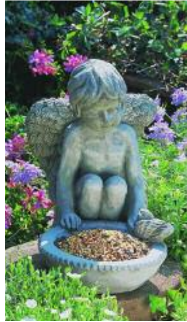
CHERUB BIRDFEEDER C-077 25 LBS - 12" x 8" x 13"