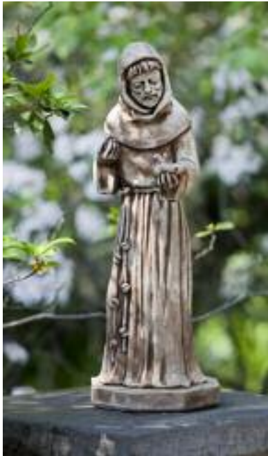
ST. FRANCIS W/BIRDS R-104 39 LBS - 8.5 x 24.75