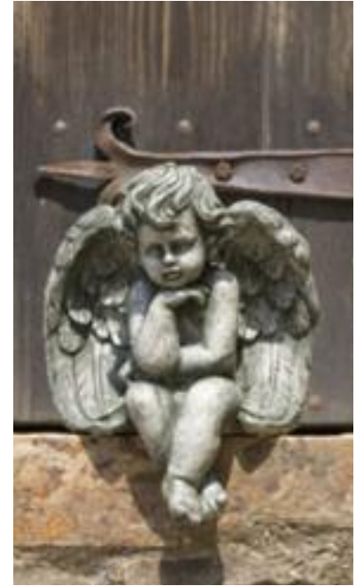
SEATED CHERUB SMALL C-101 12 LBS - 8.5" x 11.75"