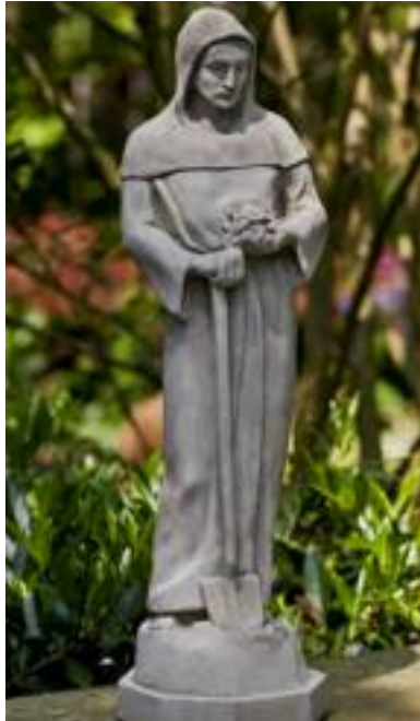
MEDIUM ST. FIACRE R-115 30 LBS - 8" x 8" x 26"